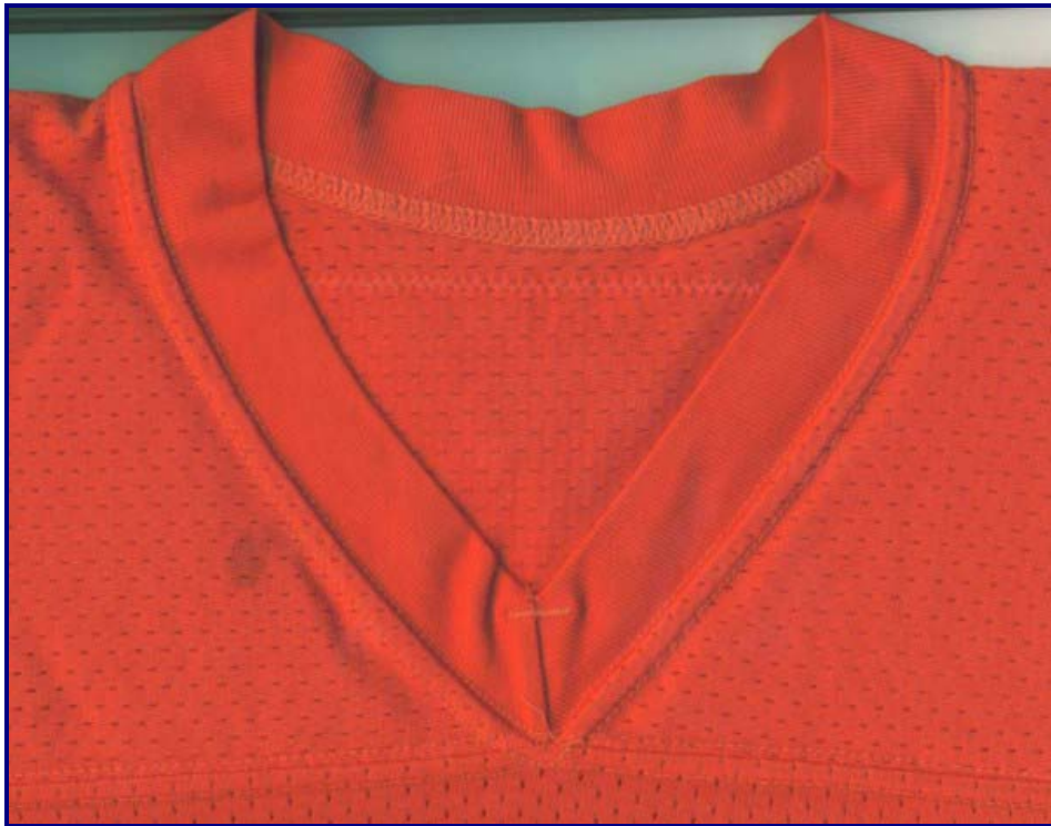
Fig 88-3. Collar detail of 1988 home jersey (T. Dorsett)