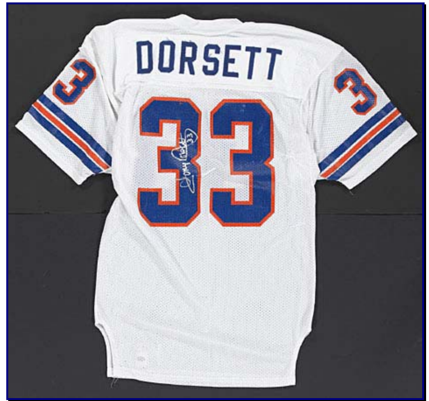
Figs 88-6 & 88-7. Front and rear view of 1988 road jersey (T. Dorsett)