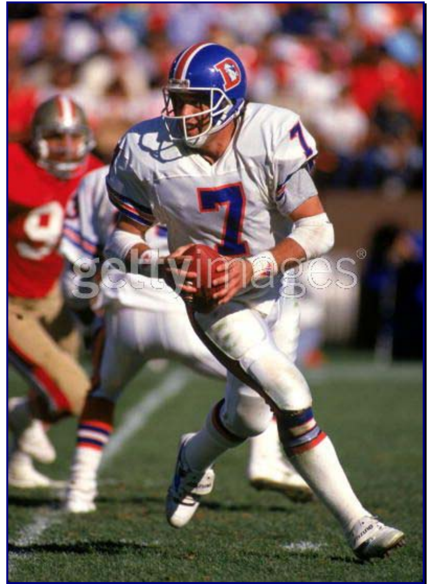
Fig. 88-2. 1989 road uniform