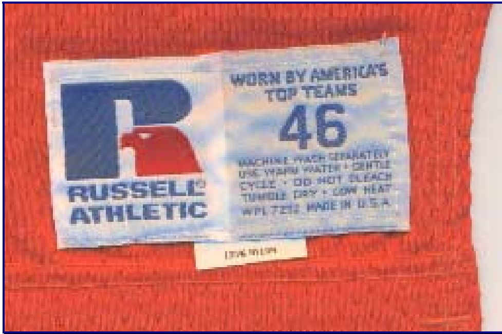
Figs 88-4 & 88-5. Manufacturer's tagging (above) and sleeve (below) detail of 1988 home jersey (T. Dorsett)