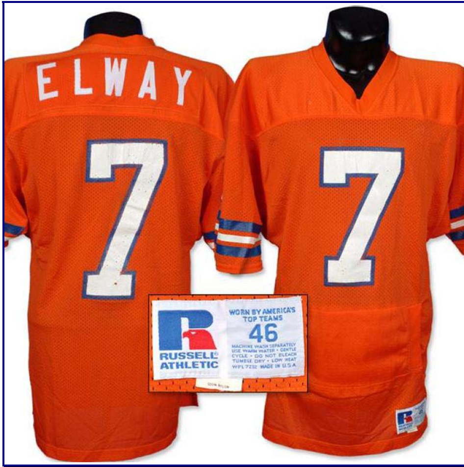
Fig 88-3. Rear and front view with tagging detail (inset) of 1988 home jersey