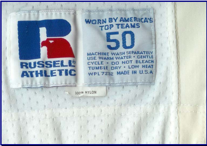
Fig. 87-5. Manufacturer's tagging from 1987 road jersey