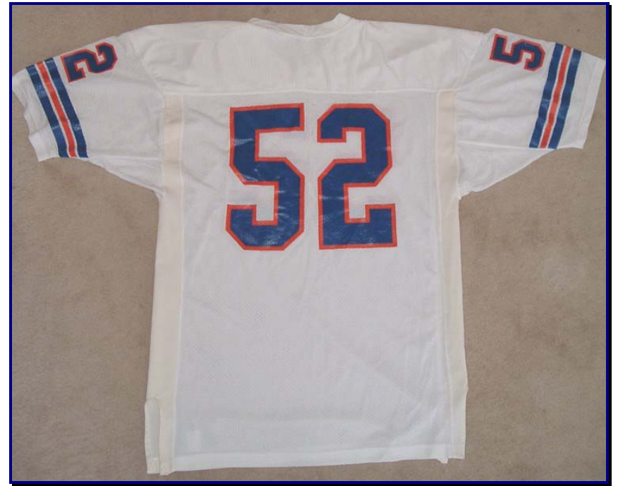
Figs. 87-3 & 87-4. Front and rear of 1987 road jersey (D. MacDonald)