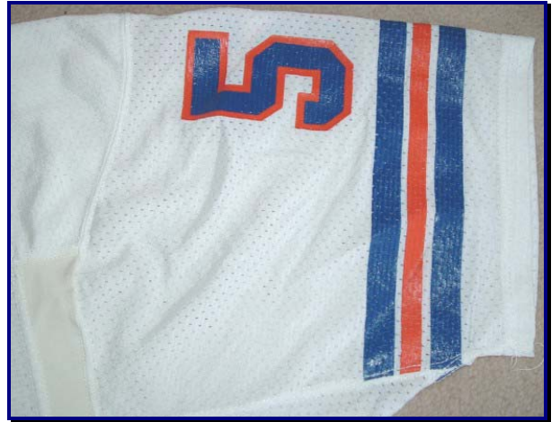
Fig. 87-6. Sleeve detail from 1987 road jersey