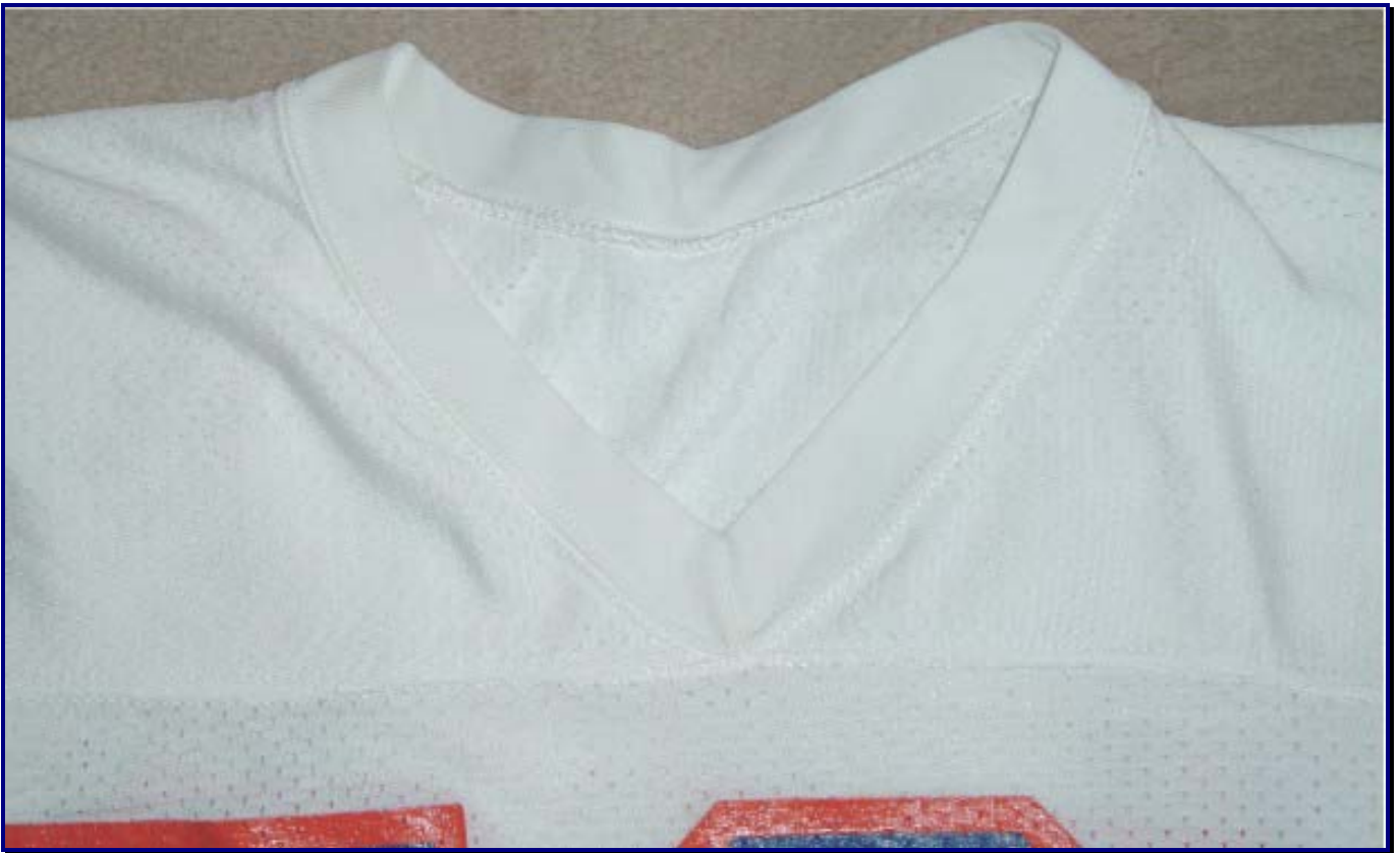
Fig. 87-7. Collar detail from 1987 road jersey