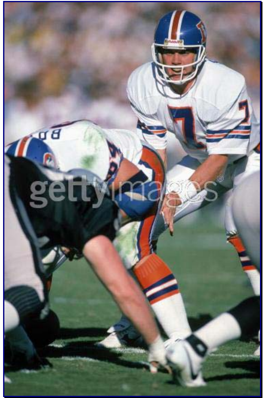
Fig. 87-2. 1987 road uniform (J. Elway, Nov 22, '87)