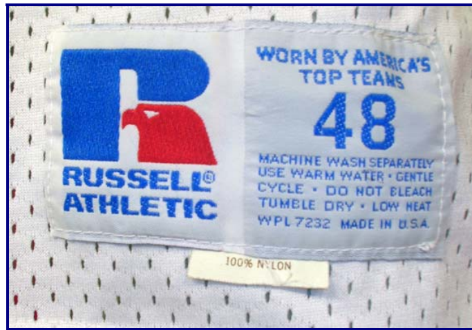
Fig. 85-5. Manufacturer's tag from circa 1985 road jersey