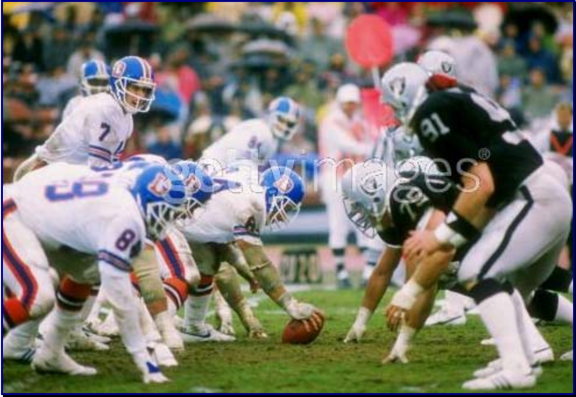
Fig. 85-8. November 24, 1986 at Los Angeles. Note Champion-style sans-serif right sleeve number (7) on Elway's jersey.