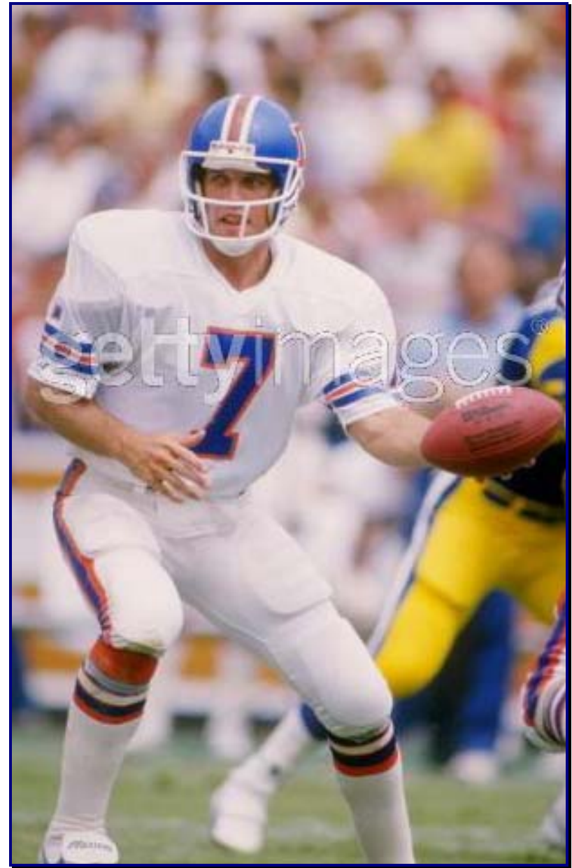
Fig. 85-2. 1985 road uniform (J. Elway).