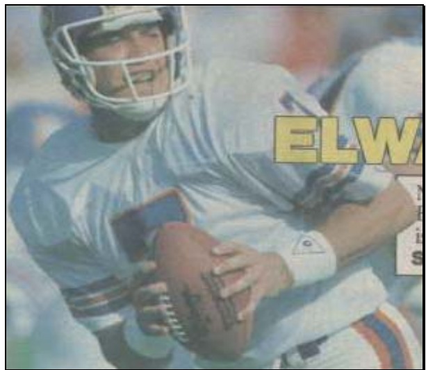
Fig. 85-7. October 20, 1986 cover of The Sporting News (Photo taken at Kansas City, 10/27/85).