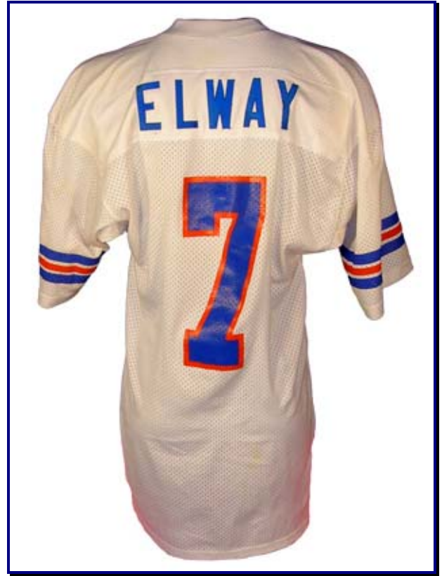
Figs. 85-3 & 85-4. Front and rear of circa 1985 road jersey (J. Elway)