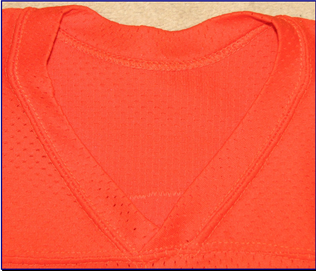
Figs. 80-5 & 80-6. Collar (above) and sleeve (below) detail from circa 1980 home jersey