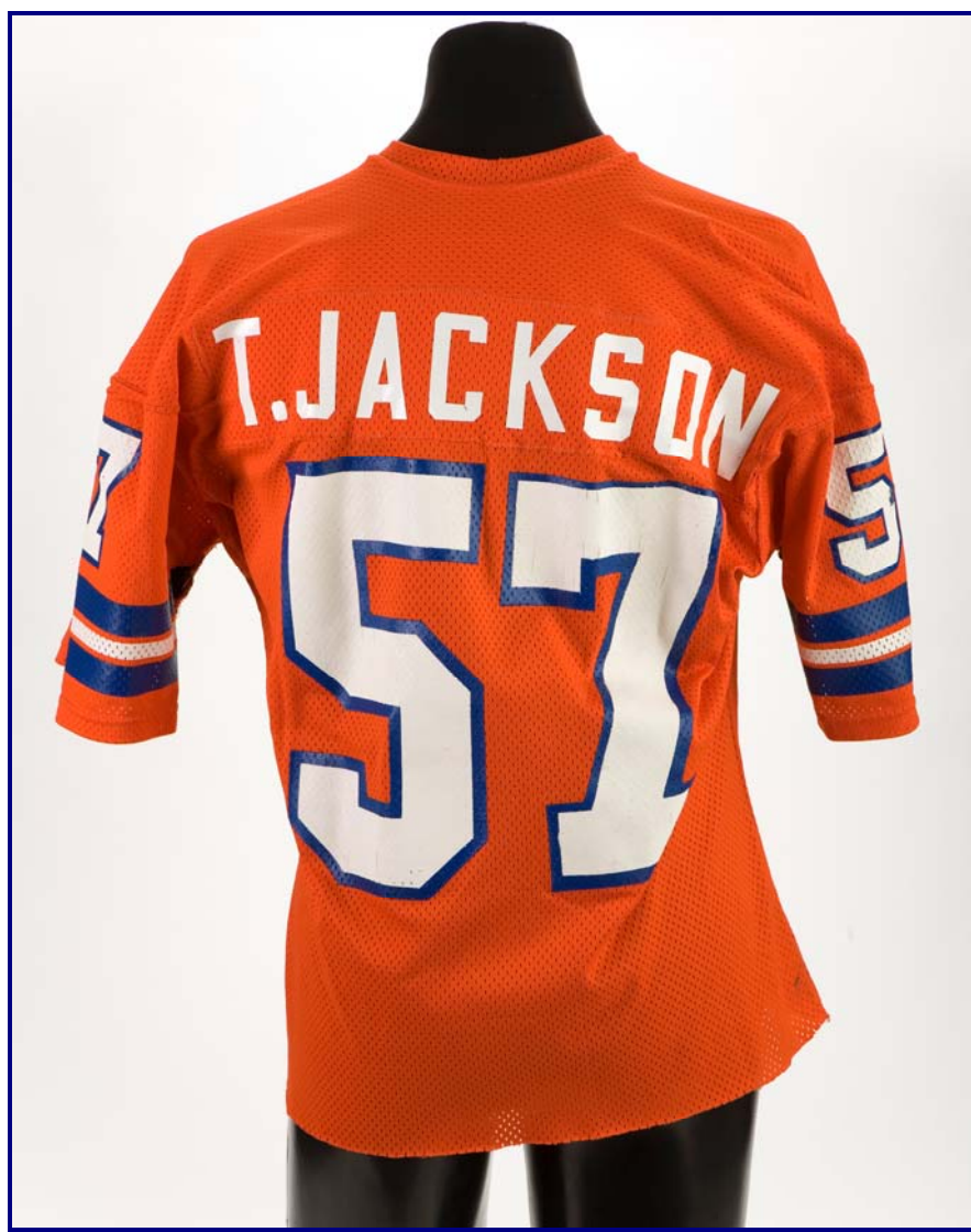
Figs. 80-3 & 80-4. Front and rear views of circa 1980 home jersey