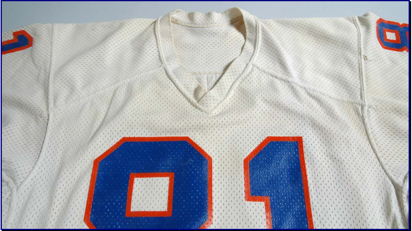
Figs. 79-10 & 79-11. Collar (above) and manufacturer's tagging detail (below) of circa 1979 road jersey