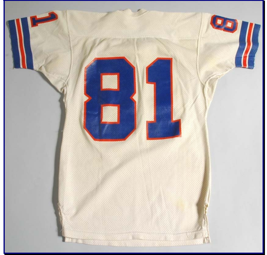
Figs. 79-8 & 79-9. Front and rear of circa 1979 road jersey (S. Watson). Note: nameplate removed.