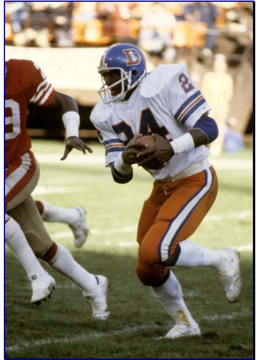
Fig. 79-2. 1979 road uniform