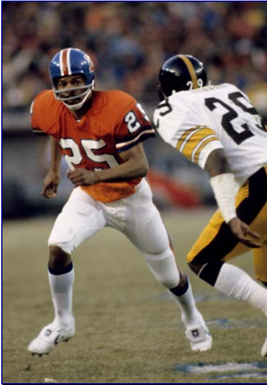
Fig. 78-1. 1978 home uniform