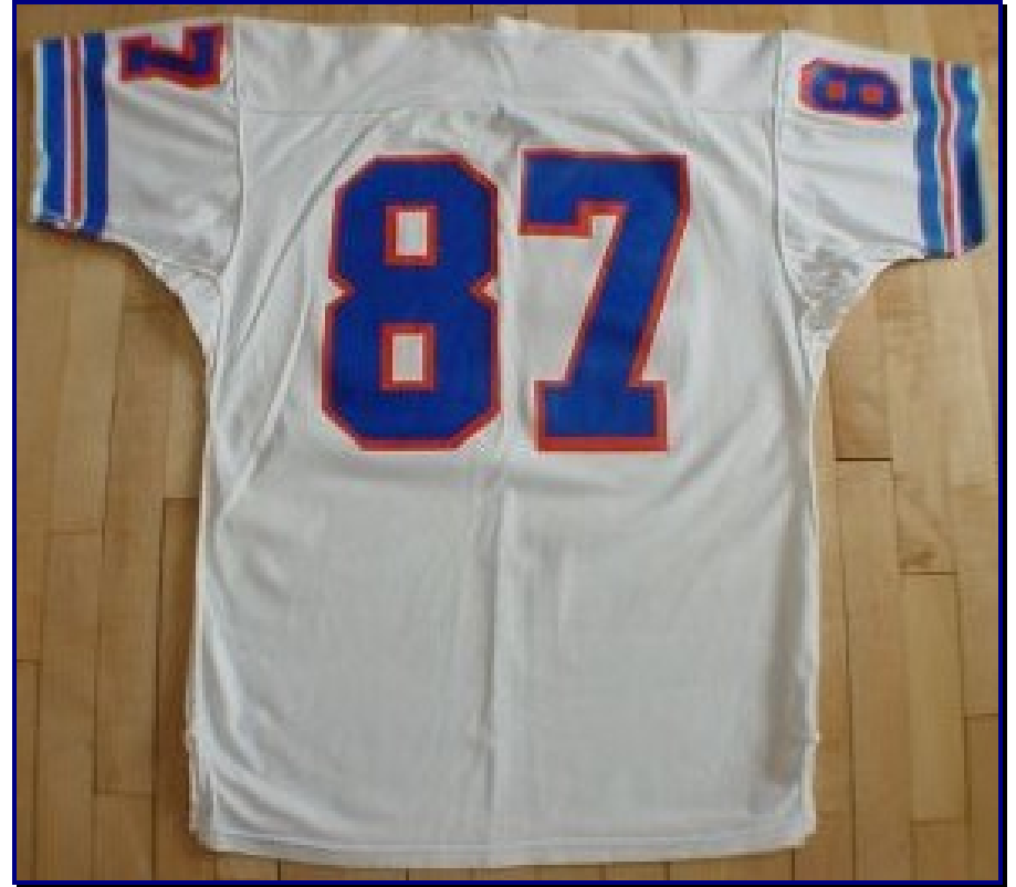
Figs. 78-8 & 79-9. Front and rear of circa 1978 road jersey (B. Moore)