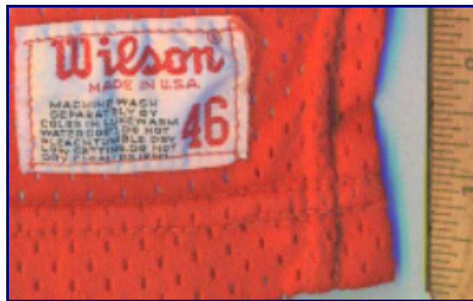
Fig. 78-7. Manufacturer's tagging detail (Note that this particular tag style dates to circa 1974-'77)