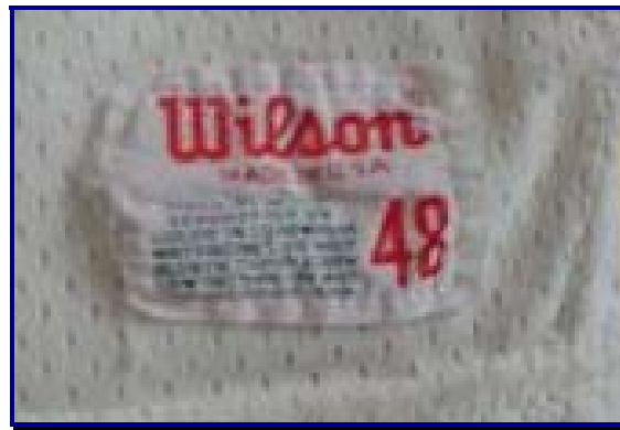
Fig. 78-10. Tagging detail of circa 1978 road jersey