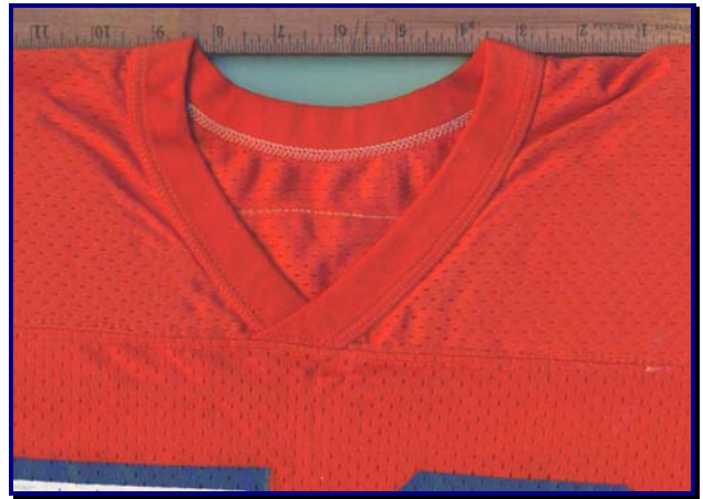
Figs. 77-4 & 77-5. Tagging (C. Morton) and collar detail (B. Maples) of 1977 home jerseys