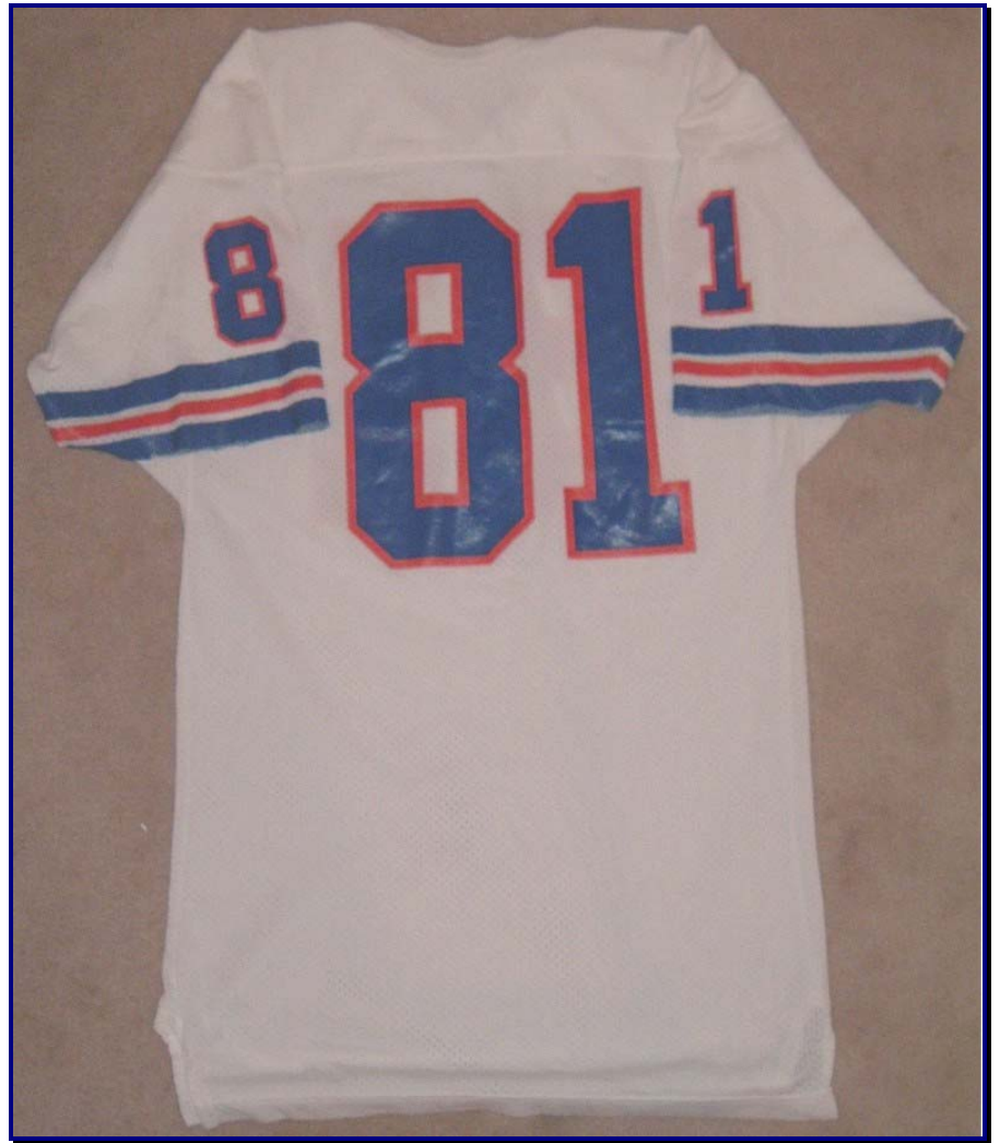
Figs. 75-8 & 75-9. Front and rear view of circa 1975 Broncos' road jersey (B. Adams)