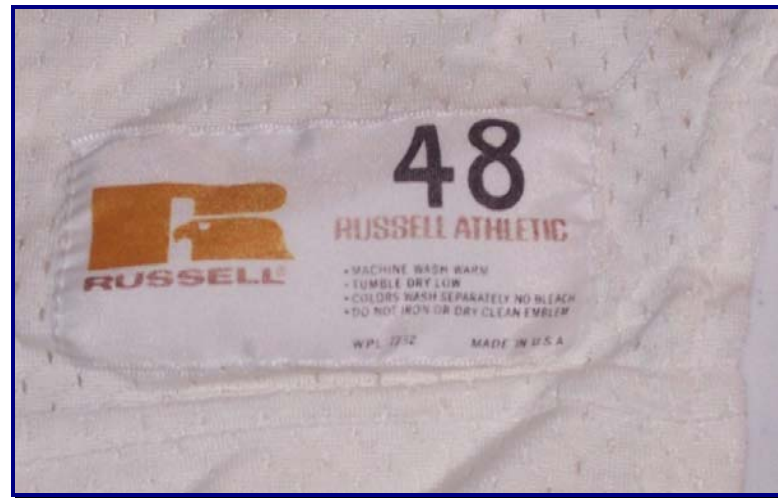
Fig. 75-10. Manufacturer's tagging detail from circa 1975 Broncos' road jersey