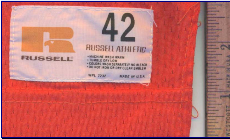
Fig. 75-6. Manufacturer's tag detail of 1975 home jersey.