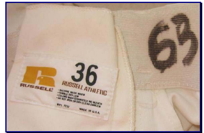
Figs. 75-11 & 75-12. Circa 1975 Broncos' uniform pants and manufacturer's tagging detail (J. Grant)