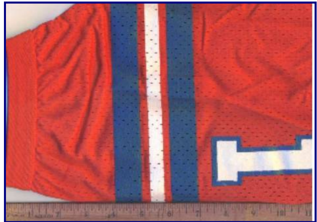
Fig. 75-7. Sleeve detail of 1975 home jersey.