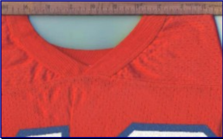
Fig. 75-4. Collar detail of 1975 home jersey.