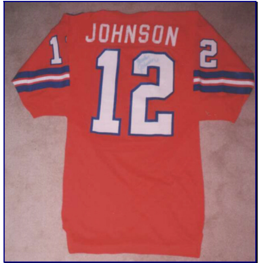
Figs. 75-2 & 75-3. Front and rear view of 1975 home jersey (C. Johnson)