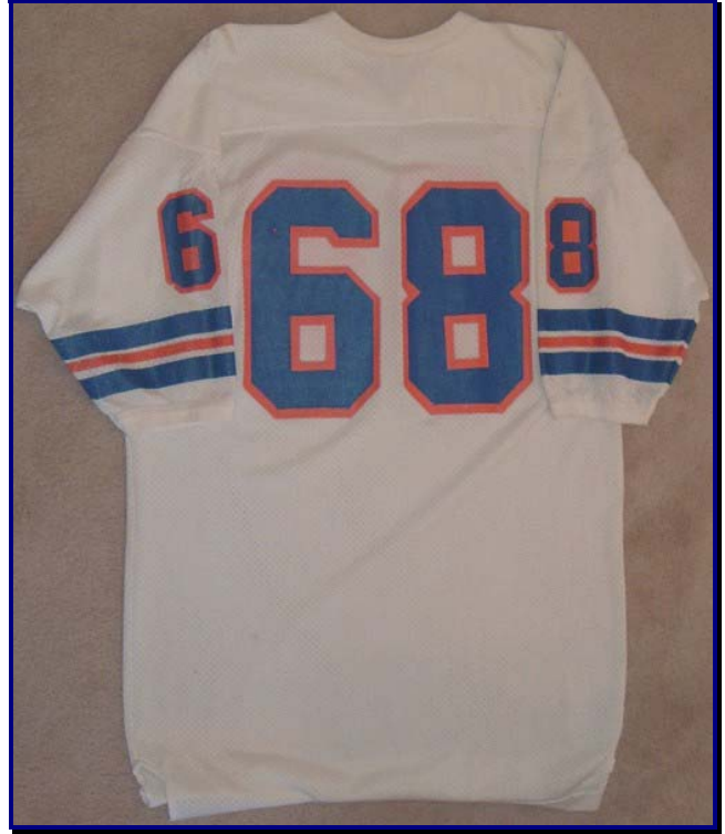
Figs. 74-6 & 74-7. Front and rear of circa 1974 road jersey (L. Jackson)