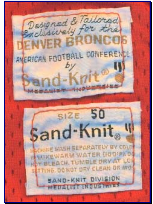
Fig. 74-4. Mfg. tagging from circa 1974 Sand-Knit home jersey with "pro-style" sizing.