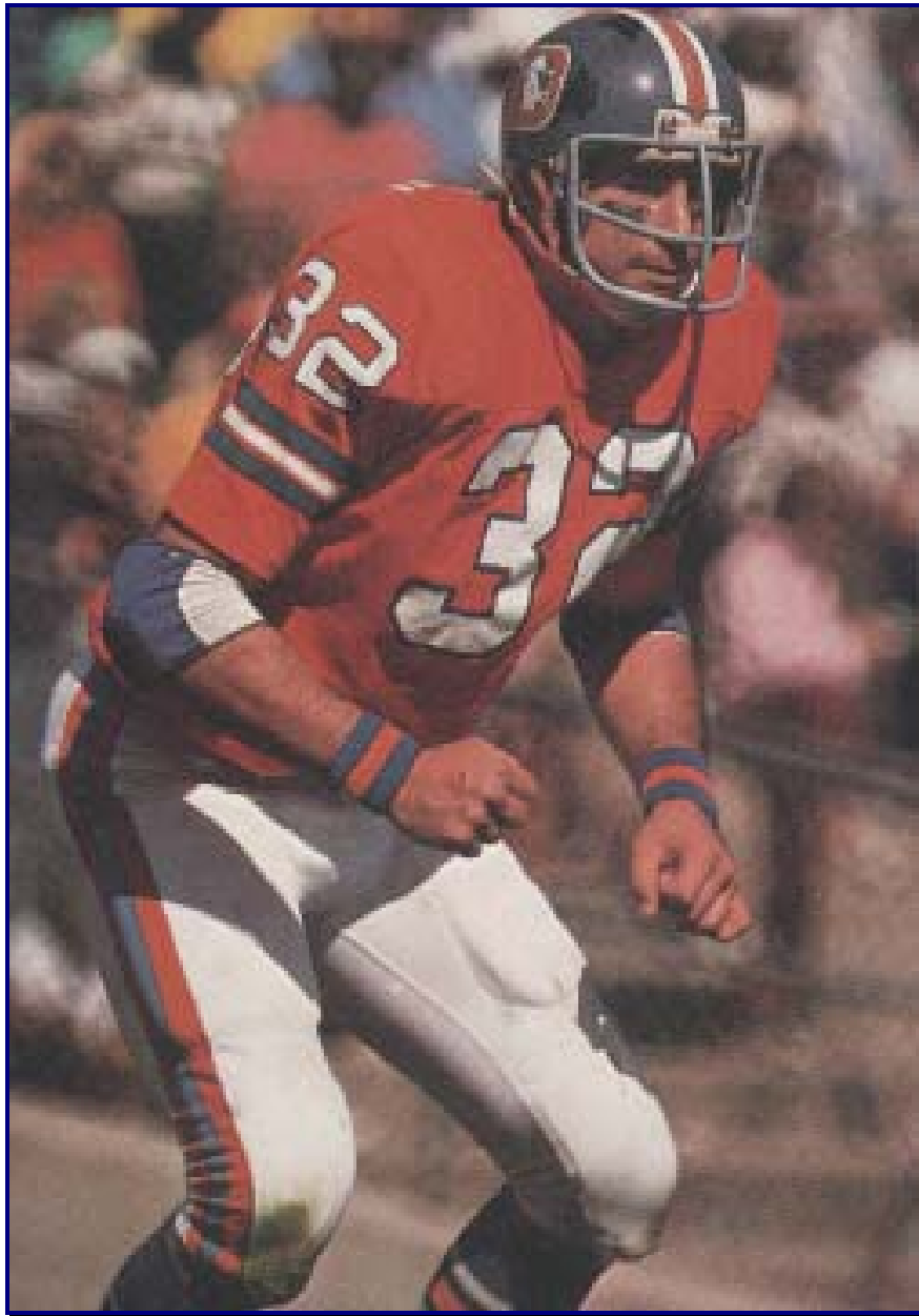
Fig. 74-1. 1974 home uniform