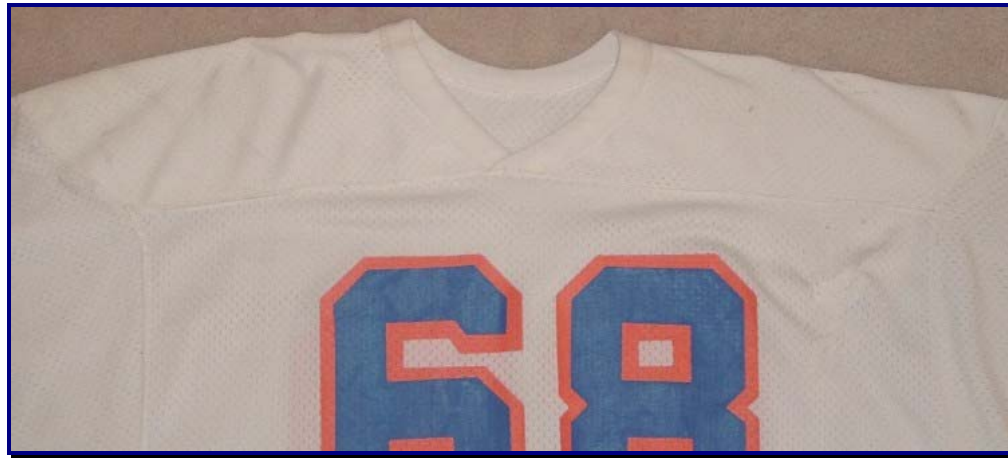
Fig. 74-8. Collar detail from circa 1974 Russell Athletic road jersey with abutted, overlapping V-neck collar