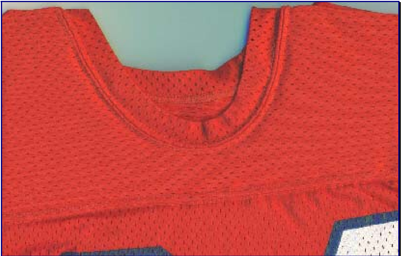
Fig. 74-5. Collar detail from circa 1974 Sand-Knit home jersey with crew neck and cowl seam passing below collar; just above numbers