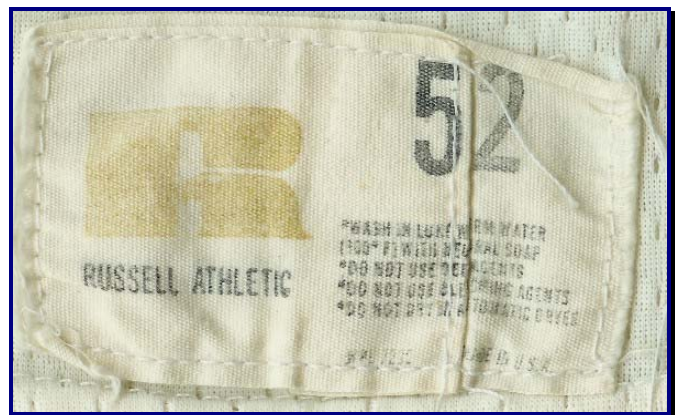
Figs. 74-9 & 74-10. Sleeve and tagging detail from circa 1974 road jersey (L. Jackson)