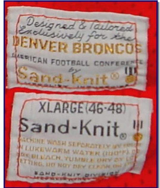
Fig. 73-4. Mnfg. tagging from circa 1974 Sand-Knit home jersey with "collegiate" sizing.