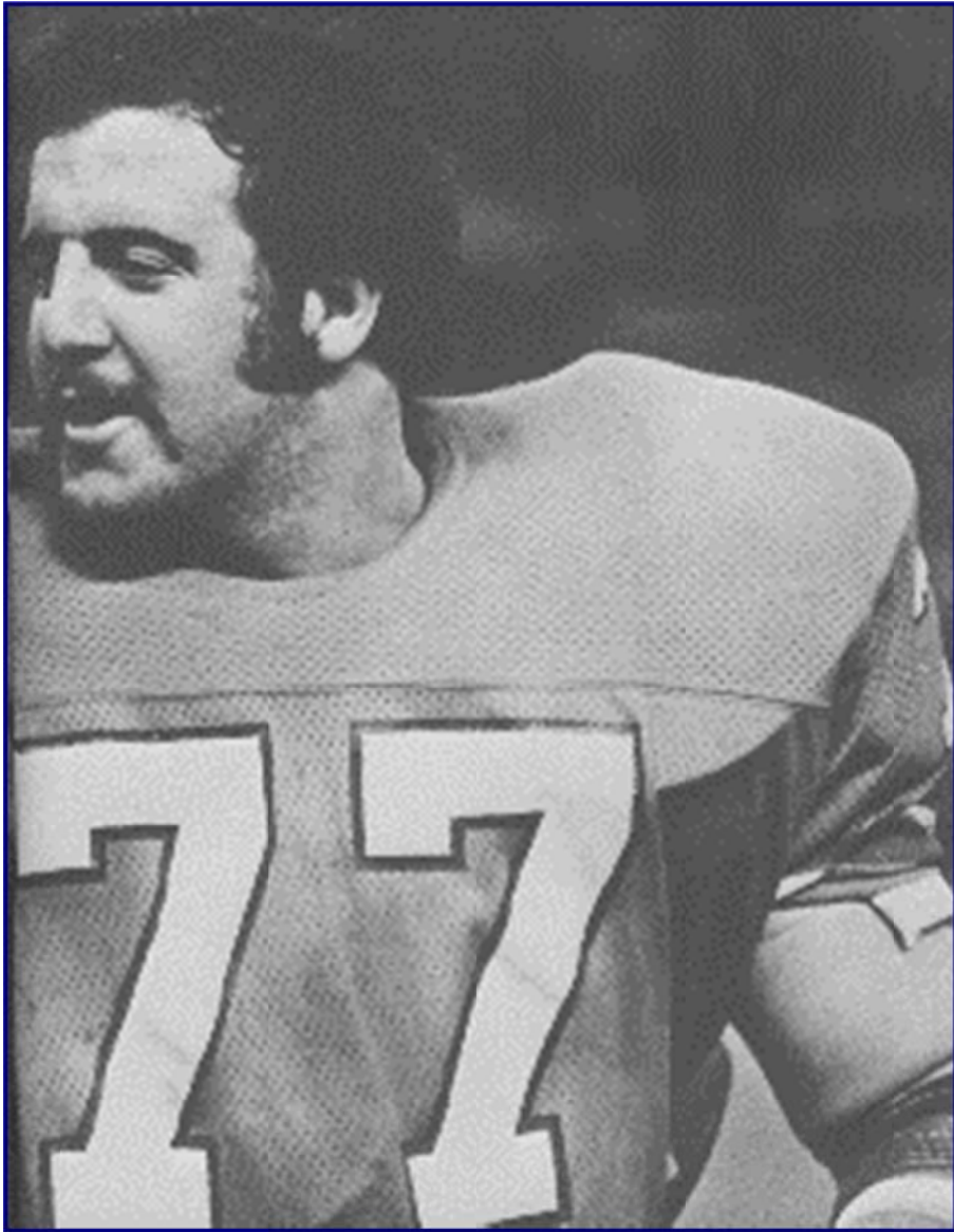
Fig. 73-1. 1973 Sand-Knit style home jersey w/ cowl seam passing below collar; just above numbers (L. Alzado, Oct. 14)