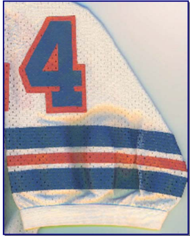
Figs. 73-5 & 73-6. Front and sleeve detail from circa 1973 Russell Southern road jersey (F. Little)