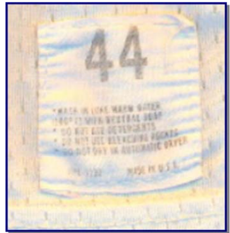
Figs. 73-7 & 73-8. Collar and wash tagging detail from circa 1973 Russell Southern road jersey