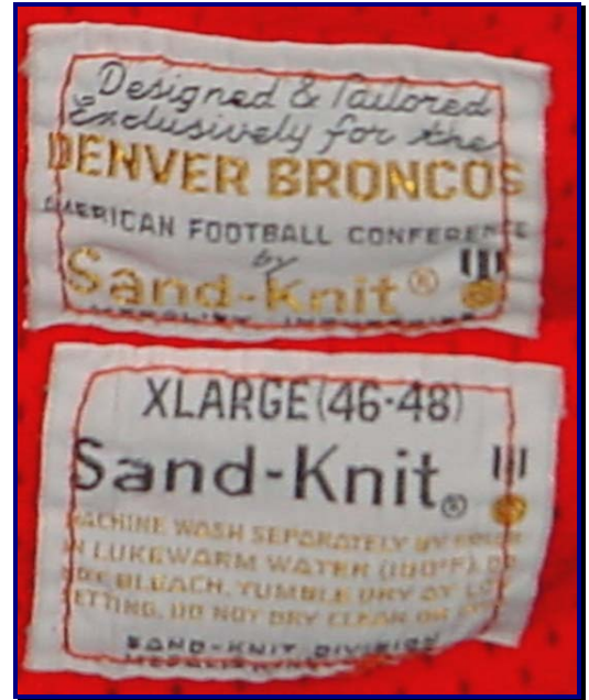
Fig. 73-4. Mnfg. tagging from circa 1974 Sand-Knit home jersey with "collegiate" sizing.