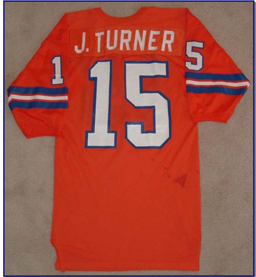
Figs. 72-3 & 72-4. Front and rear view of circa 1972 home jersey (J. Turner)