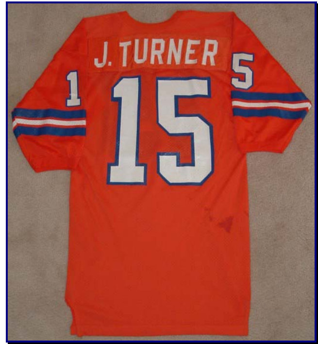
Figs. 72-3 & 72-4. Front and rear view of circa 1972 home jersey (J. Turner)