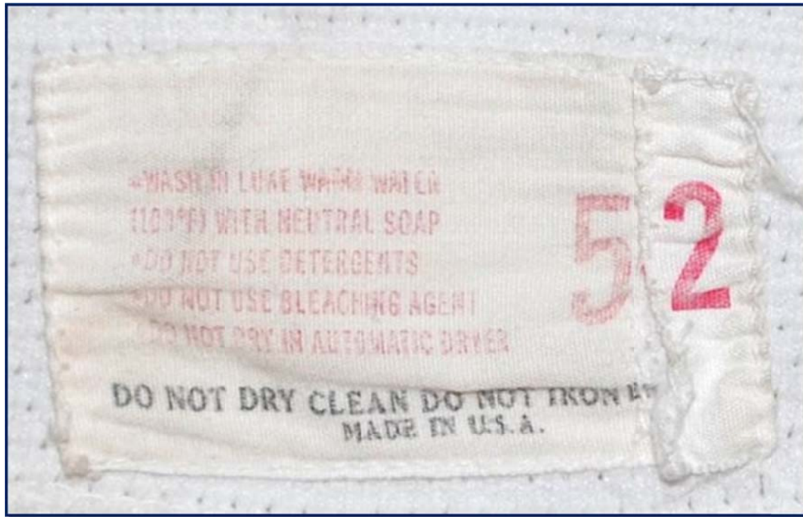
Fig. 72-10. Russell Southern wash tag detail from circa 1972 road jersey (L. Alzado)