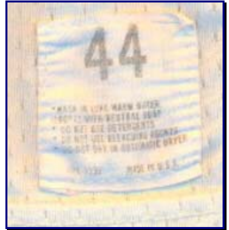
Figs. 72-10 & 72-11. Collar and (partial) tagging detail from circa 1972-'73 Russell Southern road jersey