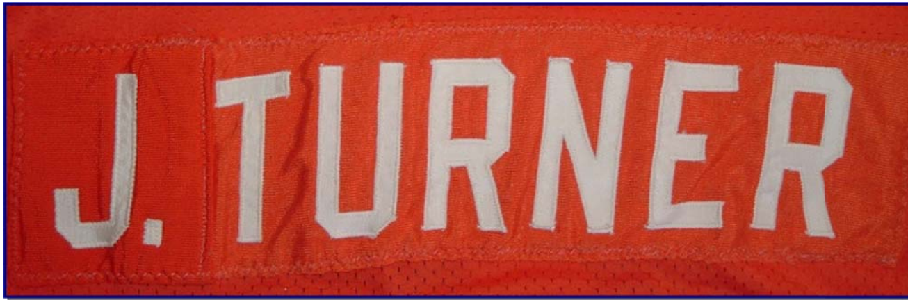
Fig. 72-5. Nameplate detail (Note tackle-twill lettering on Durene nameplate sewn on nylon mesh jersey)