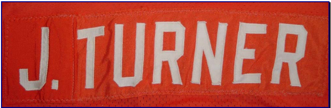
Fig. 72-5. Nameplate detail (Note tackle-twill lettering on Durene nameplate sewn on nylon mesh jersey)