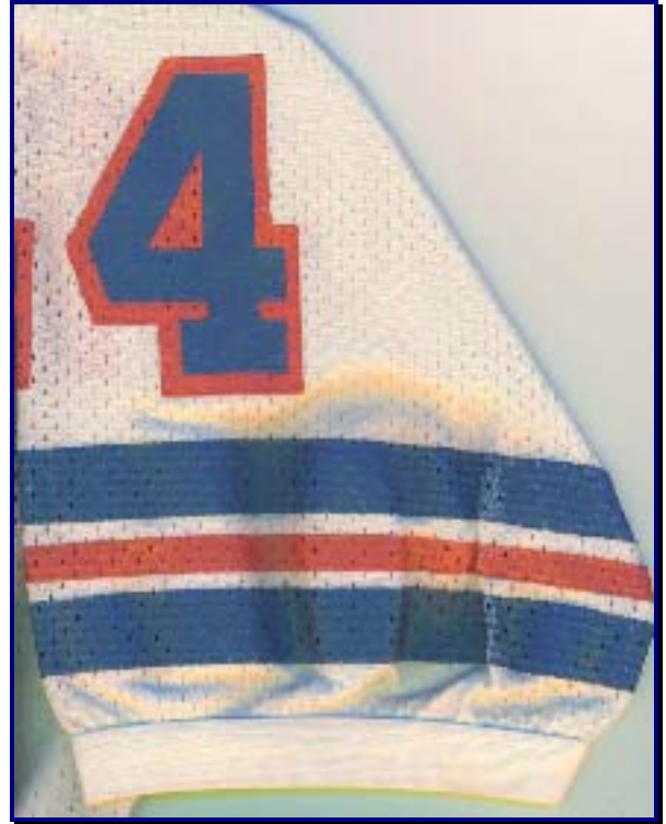
Figs. 72-8 & 72-9. Front and sleeve detail from circa 1972-'73 Russell Southern road jersey (F. Little)