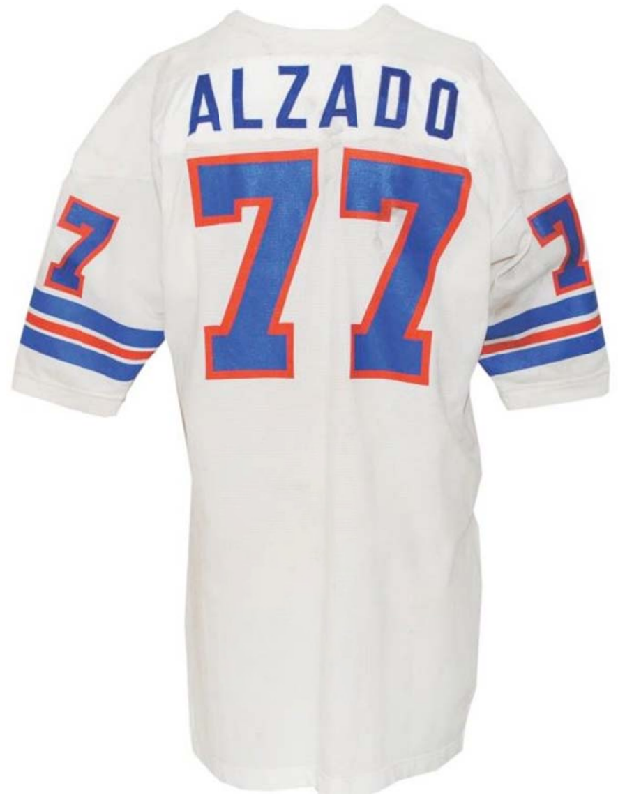
Figs. 72-8 & 72-9. Front and rear view of circa 1972 road jersey (L. Alzado)