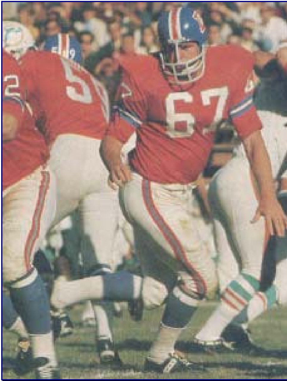
Fig. 68-1. 1968 home uniform (10/27/68).