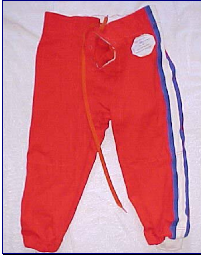
Fig. 68-3. Orange pants worn with road uniforms 1968-'71 and 1978-'79