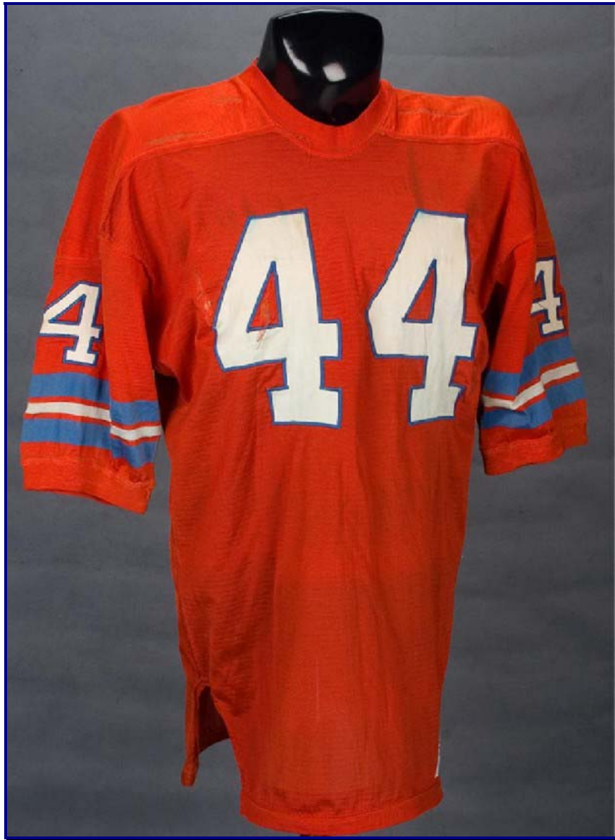
Fig. 67-3. Front of 1967-'68 home jersey (F. Little)