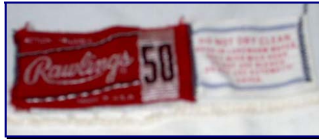
Fig. 67-8. Tagging detail of 1967-'68 road jersey