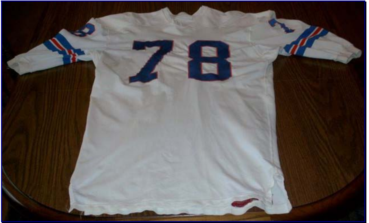
Figs. 67-6 & 67-7. Front (top) and rear (below) of 1967-'68 road jersey (T. Cichowski)