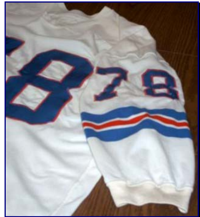
Figs. 67-9 & 67-10. Nameplate/rear number (left) and sleeve detail of 1967-'68 road jersey