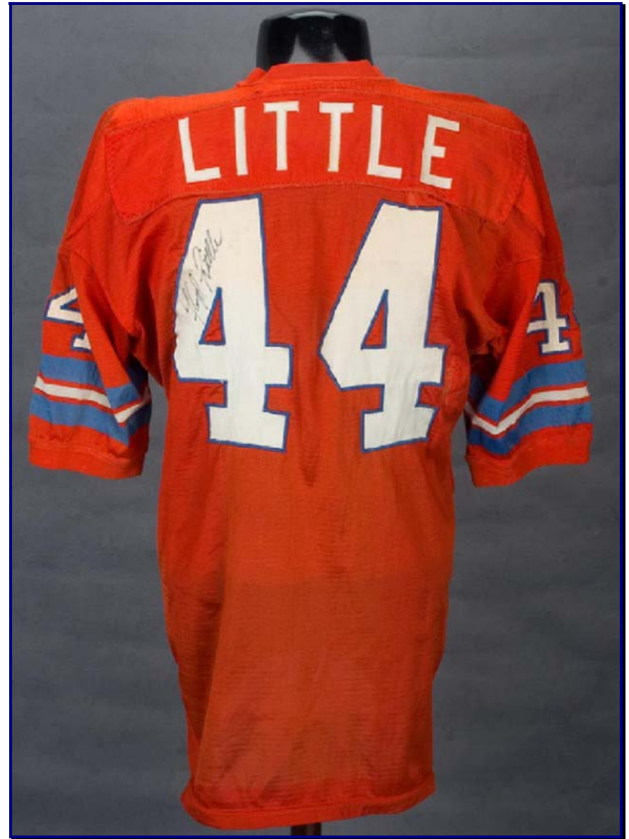
Fig. 67-4. Rear of 1967-'68 home jersey with team-restored nameplate on back