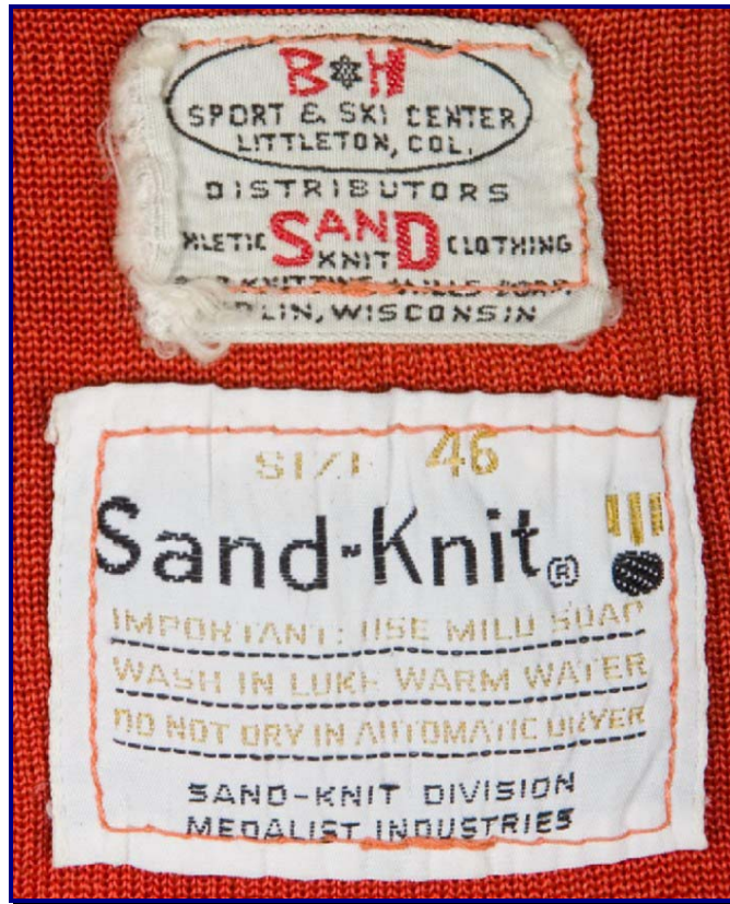
Fig. 67-5. Circa 1967-'68 Medalist Sand-Knit manufacturing tag incorporating sizing designator and laundering instructions; with upper "exclusive" tag identifying distributor as "B&H Sport and Ski Center" of Littleton, Colorado