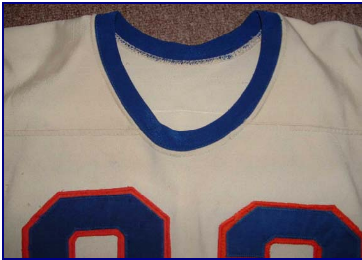
Fig. 65-7. Collar detail from circa 1965 road jersey.