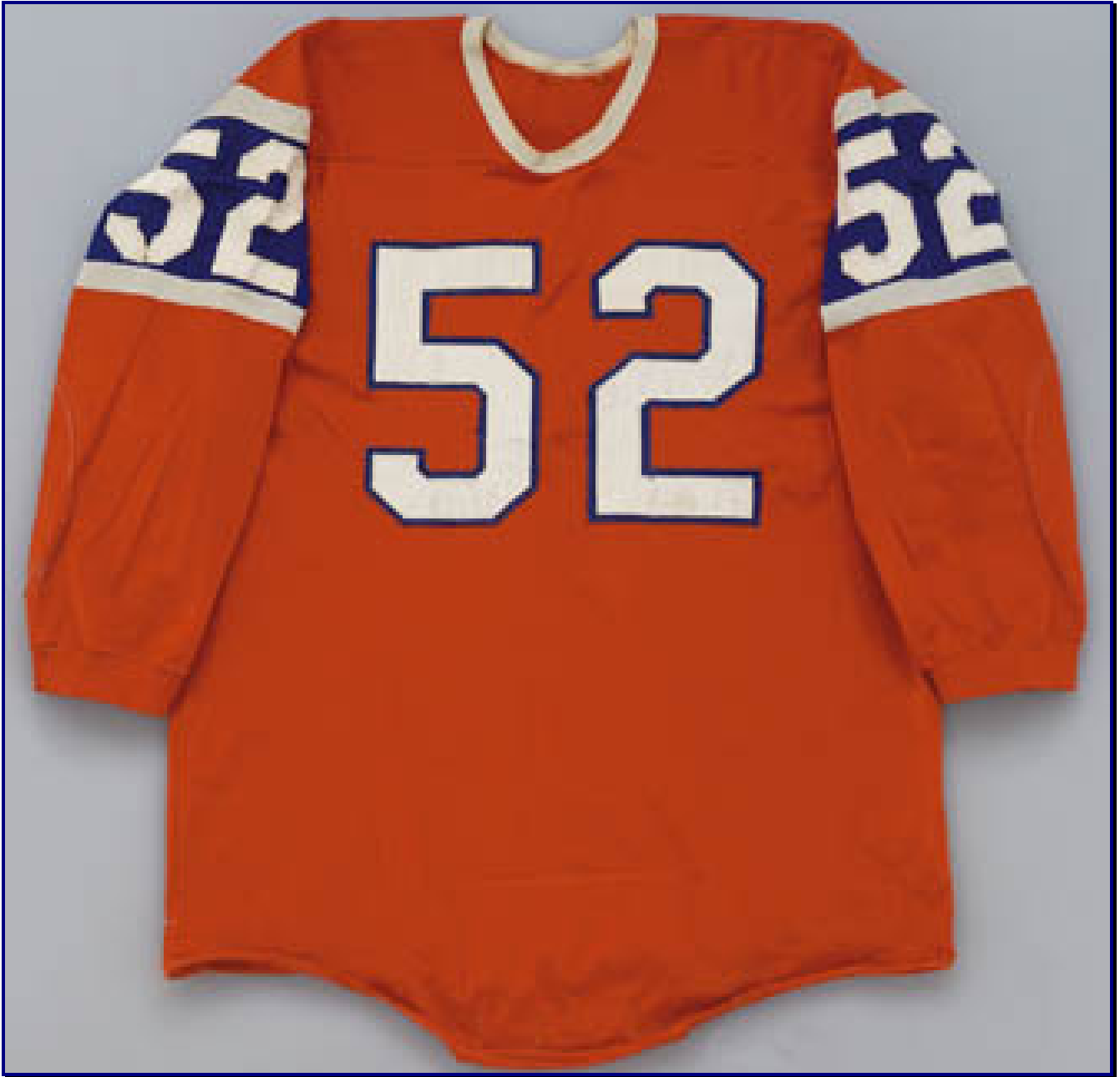
Fig. 65-3 Front view of circa 1965-'66 home jersey (R. Kubala). Note cut crotch strap.