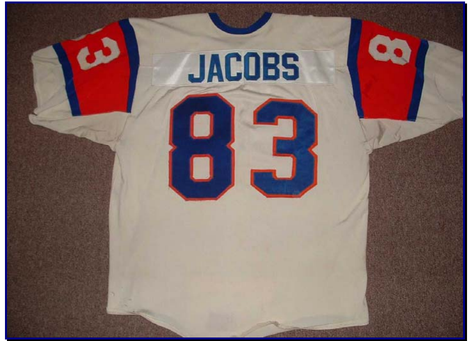
Figs. 65-5 & 65-6. Front and rear view of circa 1965 road jersey (R. Jacobs). Note cut sleeves and crotch strap and restored nameplate.