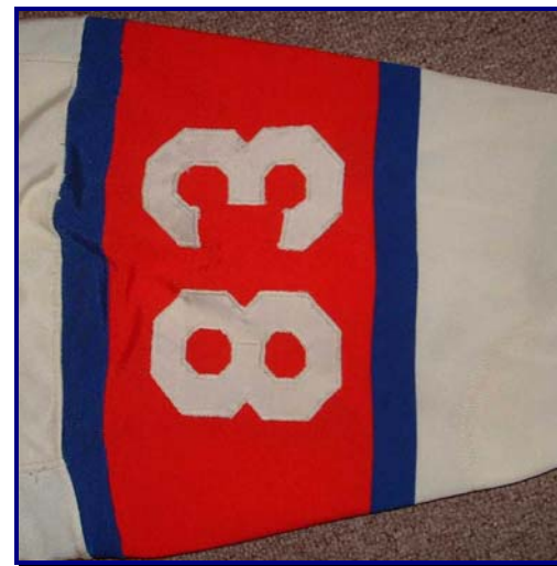
Fig. 65-8. Sleeve detail from circa 1965 road jersey.