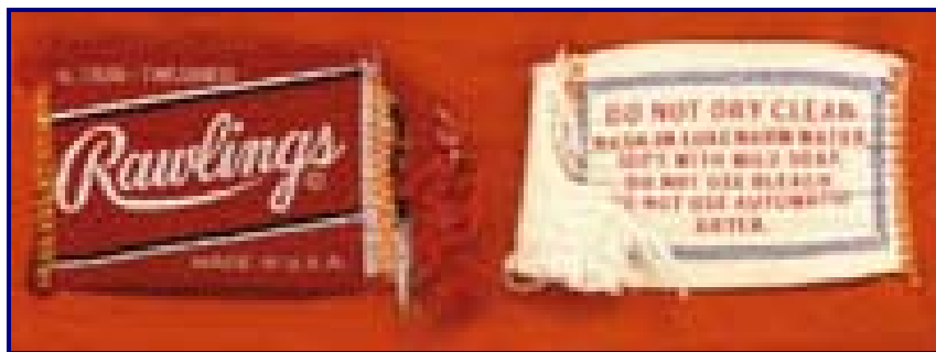
Fig. 65-4. Tagging detail (located inside front tail) from 1965-'66 Rawlings home jersey.