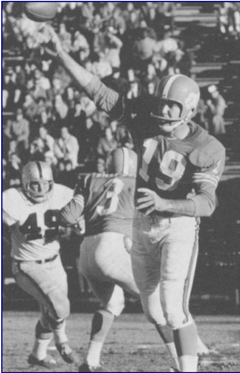
Fig. 63-1. 1963 home uniform