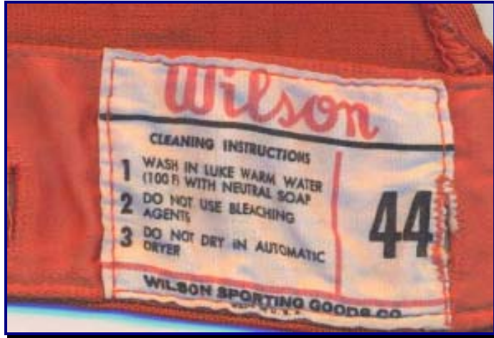
Fig. 63-5. 1963 Wilson Sporting Goods manufacturer's tag detail