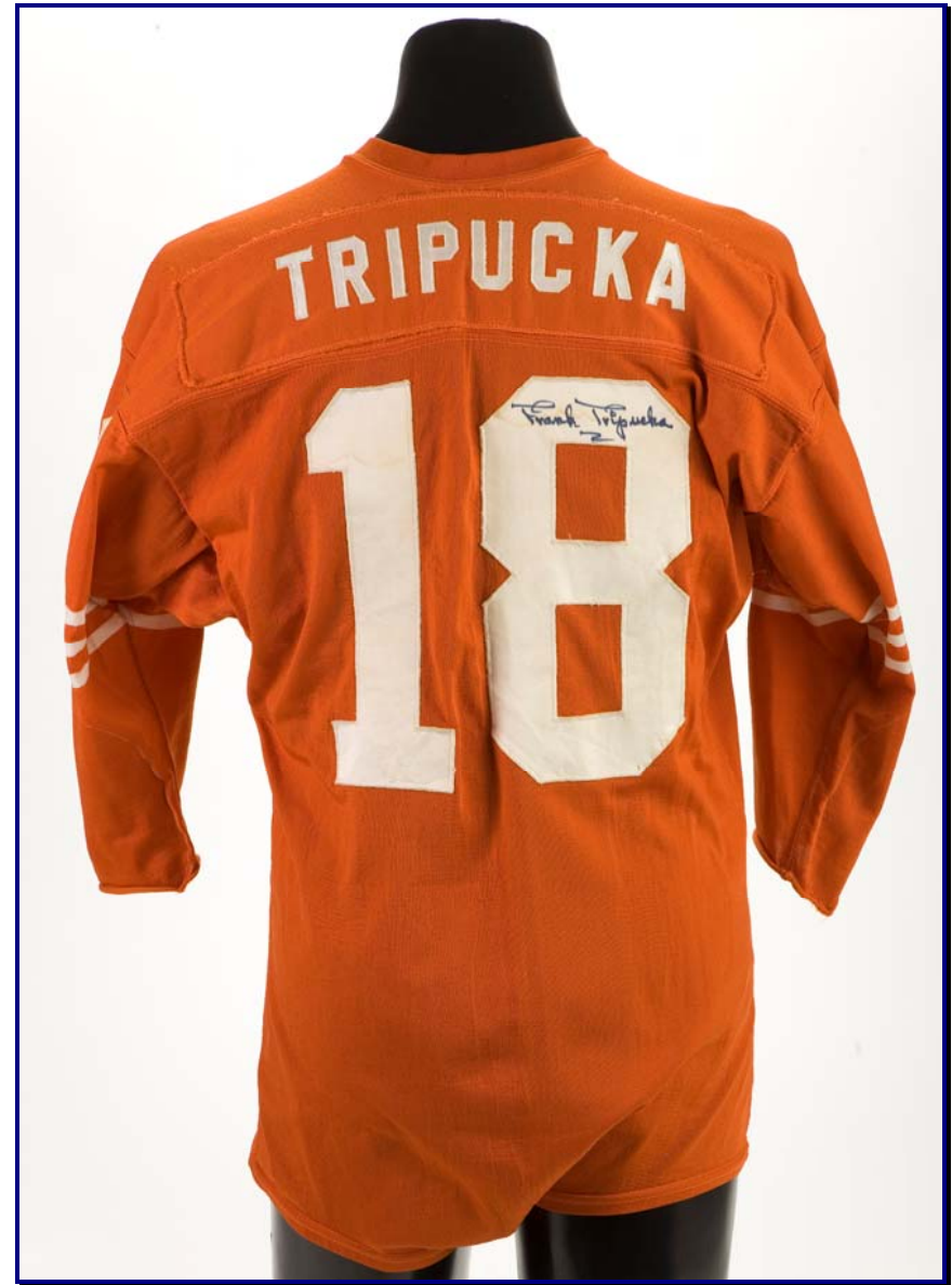
Figs. 63-3 & 63-4. Front and rear view of 1963 home jersey (F. Tripucka)