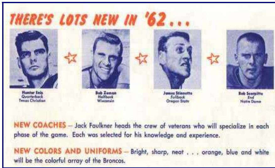
Fig. 62-3. A 1962 season ticket sales brochure promoting the “Newcolors and uniforms”.