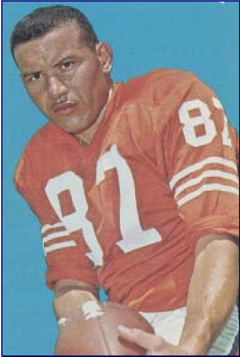
Fig. 62-1. 1962-'64 era home uniform